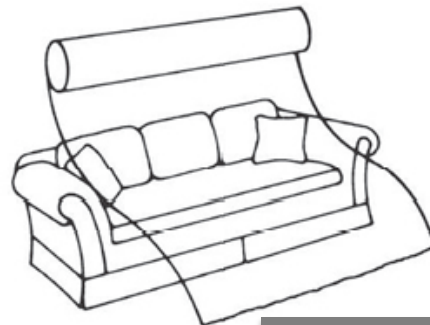
Up the Bolt